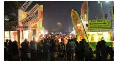
This Small Town Mississippi Festival Is Too Charming For Words...And You Don't Want To Miss It