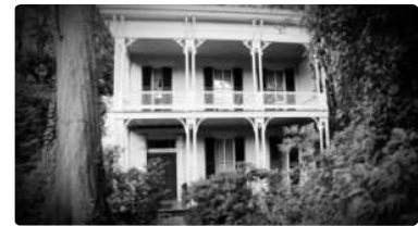
8 Haunting Tours In Mississippi That Will Send Chills Down Your Spine