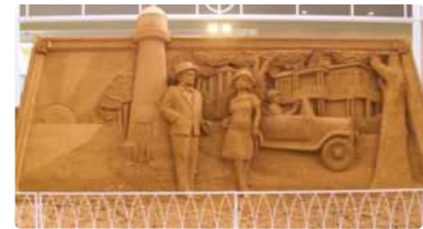
Don't Miss Your Chance To See These Unbelievable Sand Sculptures In Mississippi