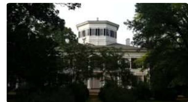
The Story Behind Mississippi's Most Haunted House Is Beyond Terrifying